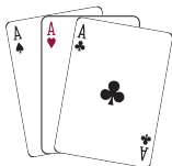
Jacks or Better